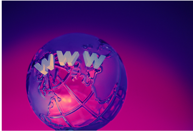
Figure 1. Figure captions are indented 5 spaces and justified. If you are familiar with Word styles, you can insert a field code called Seq figure which automatically numbers your figures.

Figures are centered. Use or insert .jpg, .tiff, or .gif illustrations instead of PowerPoint or graphic constructions. Captions go below figures. Indent 5 spaces from left margin and justify.