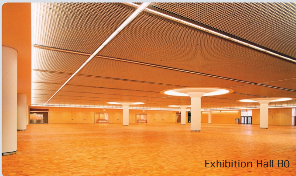
Exhibition Hall B0

For details see the plan on the next page.