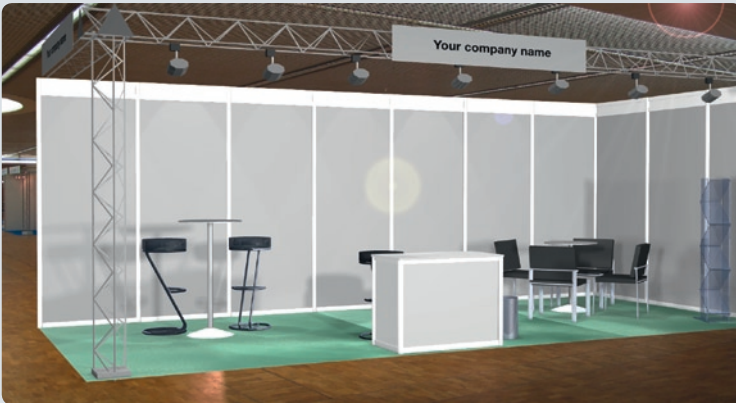
Booth 1: 21 sqm