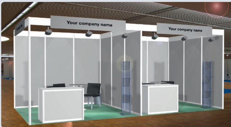
Booth 2: 9 sqm