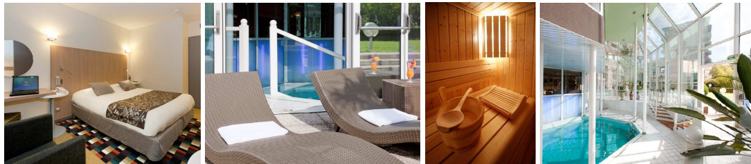
Terrasse ... Espace fitness ... Jacuzzi ... Sauna et Bar Le Sirius

11, rue Général Mangin 38100 Grenoble – France Tel : + 33 4 76 56 26 56 Fax : + 33 4 76 56 26 82 Mail : h2947@accor.com